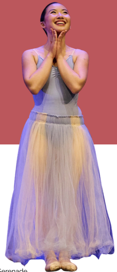
Serenade Choreography by George Balanchine © The George Balanchine Trust